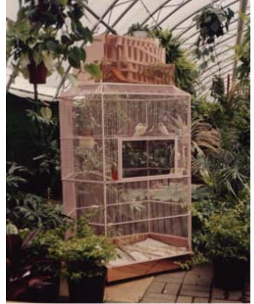
A mixed flight for budgies and Australian parakeets within this botanical garden enjoys the natural sunlight, tropical mist and visitors' appreciation.

Certainly, avian specialists will all confirm that our birds' cages must be spacious, the largest possible. A simple